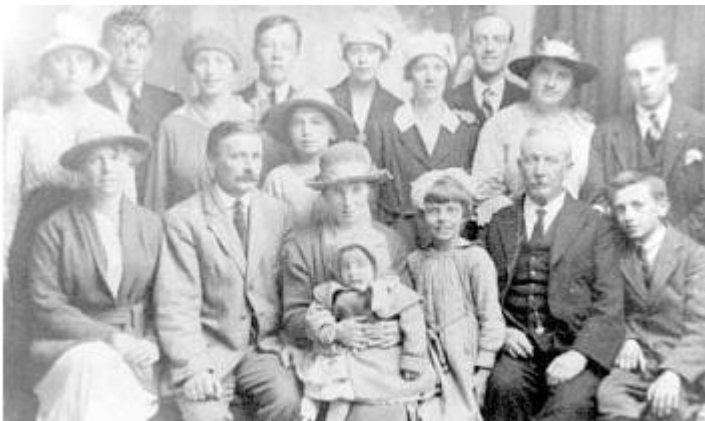
1914 Group photograph of church members